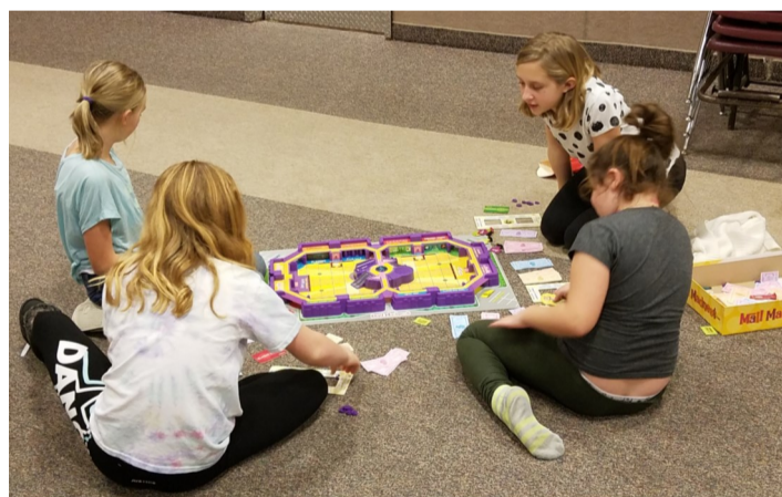
Playing games at the Chili Cook-Off